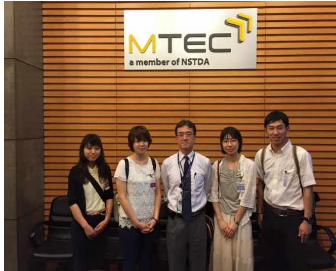
MTEC (a member of NASDA)